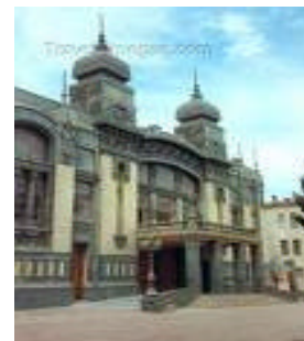
Opera and Ballet Theater

find other former Soviet cuisines represented by Russian, Ukrainian and Georgian restaurants; Mediterranean— by Lebanese and Greek food places; Asian— by Chinese, Thai & Indian; Western— by Mexican, American, Italian, French restaurants and more. Drama, ballet and opera are much appreciated in Baku. There are a number of theaters with diverse repertoires drawn both from rich local collections and international heritage. The vibrant city life is also supported by numerous museums, galleries, movie theaters and concert halls hosting sizeable performers.