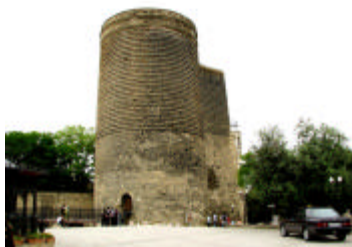
Maiden Tower , the unofficial symbol of Baku

The old city, Icheri Sheher located within the walled fortress is the first site in Azerbaijan added by UNESCO to the World Heritage List with its cobbled narrow streets and several historical monuments. One of them is the Shirvan Shahs Palace, the residence of dynasty of medieval rulers of 15 th century. Another one is the Maiden's Tower (Giz Qalasi), the main landmark of Baku – an eccentric tower built around 7 th -8 th centuries to serve as a light house, defense fortification, astronomical observatory or Zoroastrian temple. The Walled City also has several mosques with the most famous one among them Juma Mesjid (Friday Mosque) which used to house a Rug & Art museum during Soviet times but is now returned to its original purpose.