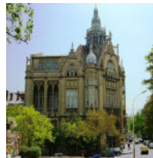
Palace of Happiness, main wedding venue of Baku

Today this 1500 year old city is represented by four different types of architecture. Besides the Medieval Walled city, there is a part of town built during the first oil boom of mid 19 th century through 1920. This area is rich in eclectic European style buildings designed by prominent architects who were hired and brought to Baku from countries such as Poland, Germany, Austria, Italy, France, Russia, etc. Then there is the Soviet era Baku of dull concrete monoliths and finally the most modern offices and residential buildings developed within the past 15 years or so - some truly upscale, some of questionable quality and value as they interfere with the existing skyline.