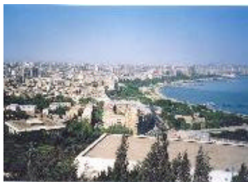
View of Baku

A wide and for the most part of it shady pedestrian walkway runs downtown along the side of the Caspian Sea. It is a waterfront park mainly referred to as Boulevard . From there you can take a boat tour of Baku Bay that lasts about 40 min.